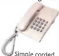
Simple corded telephone