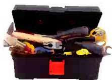
Basic tool kit: utility knife, pliers, screwdriver, duct tape, wrench, hammer