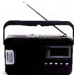
A wind-up, solar or battery-operated radio