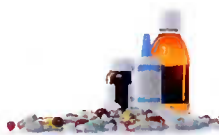
A minimum one-week supply of critical medications and copies of all prescriptions