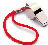
Signal flares, whistle or horn