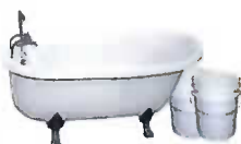
Two (2) buckets of water, and the bathtub filled with water