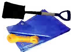
Small shovel, large tarp and rope